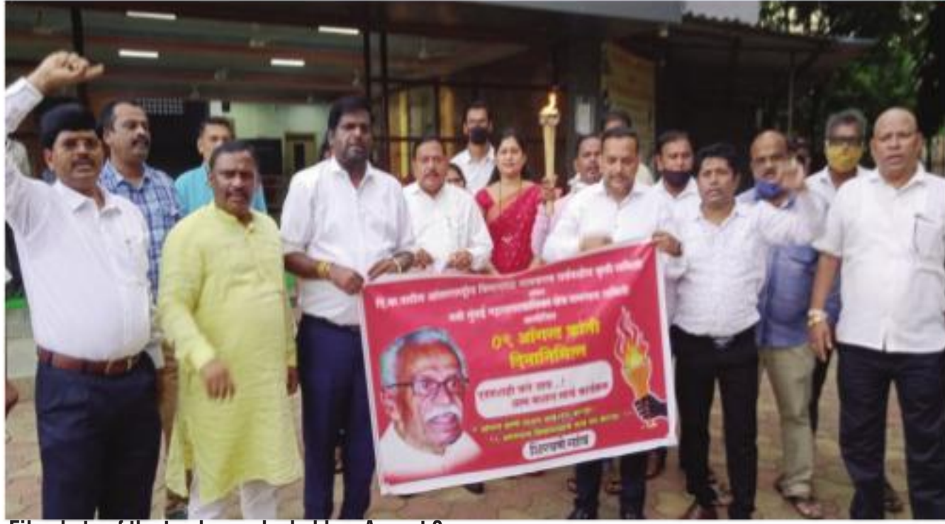
File photo of the torch morcha held on August 9

The Uran police have registered an FIR against 750 protesters, including senior members of Navi Mumbai All-Party Action Committee (NMAPAC), for allegedly holding the Mashal March (Torch Morcha) on August 9 in Jasai village and other parts of the city without permission. The Navi Mumbai police had even issued them a notice under CrPC Section 149 (unlawful assembly) that prevents gathering of more than five people.