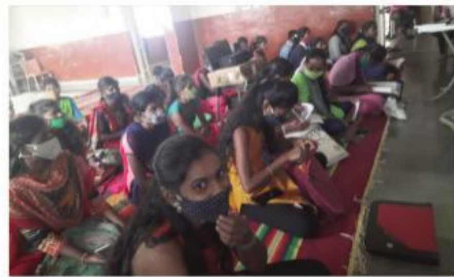
Youths fill up forms at the Divya Vidyalaya in Jawhar Taluka

Over 150 youths from the tribal villages of Jawhar and Mokhada talukas in Palghar filled up recruitment forms on Tuesday for the Border Security Force (BSF), the Indo-Tibetan Border Police, the Central Industrial Security Force (CISF) and the Special Security Force (SSF). The camp was organised at Diyya Vidyalaya, a school for blind and mentally challenged persons, in Jawhar. The initiative is aimed at helping tribal youths enhance their social status; 140 girls and 24 boys participated in the camp.